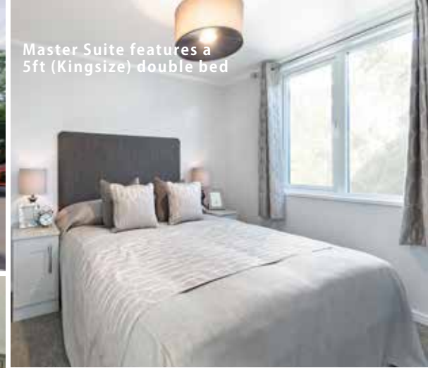
Master Suite features a 5ft (Kingsize) double bed