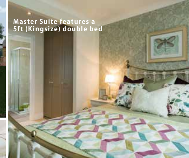
Master Suite features a 5ft (Kingsize) double bed